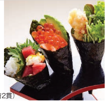
Temaki and Inari Assorted 3 hand rolls and 2 sushi pockets. 手巻きセット (手巻き3種と稲荷2貫) (お味噌汁付) It comes with miso soup. RM52.00