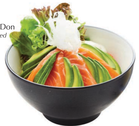
Salmon & Avocado Don A bowl of sushi rice topped with salmon & avocado. (お味噌汁付) It comes with miso soup. サーモンアボガド丼 RM35.00