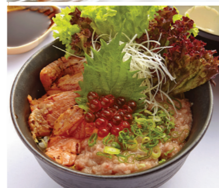
Negitoro Aburi Salmon Don A bowl of sushi rice topped with minced tuna mid belly and seared salmon. ネギトロと炙りサーモン丼 (お味噌汁付) It comes with miso soup. RM55.00