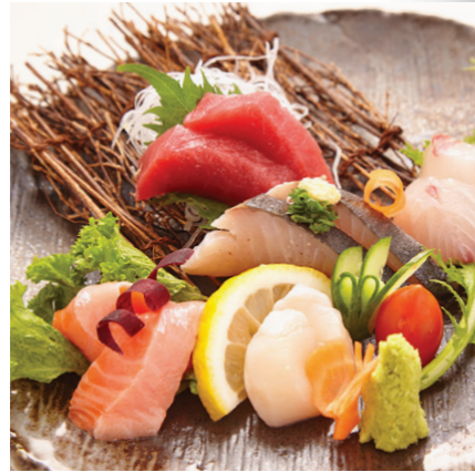
5 Kinds of Sashimi Set Assorted Fresh Ocean Sashimi. お刺身盛り合わせ (5種) RM110.00