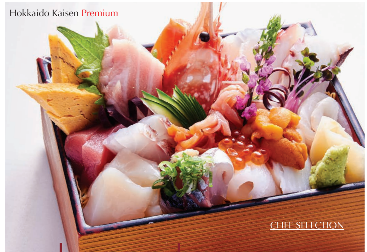
Hokkaido Kaisen Premium