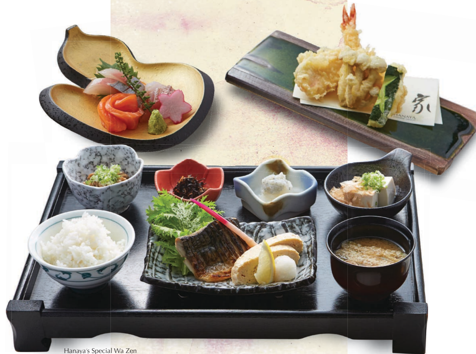
Hanaya's Special Wa Zen