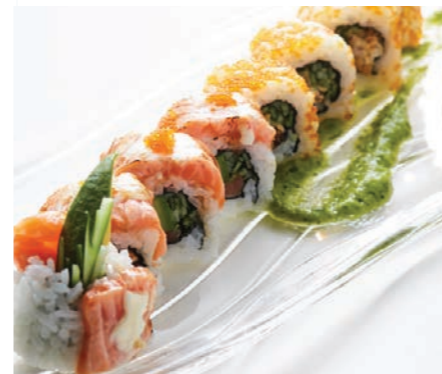
Inside Out Rolls You have 2 choices of ingredients. -Salmon & Avocado -Tuna & Avocado -Prawn Tempura -Soft Shell Crab -California Roll 裏巻き (2種) (お味噌汁付) It comes with miso soup. RM35.00