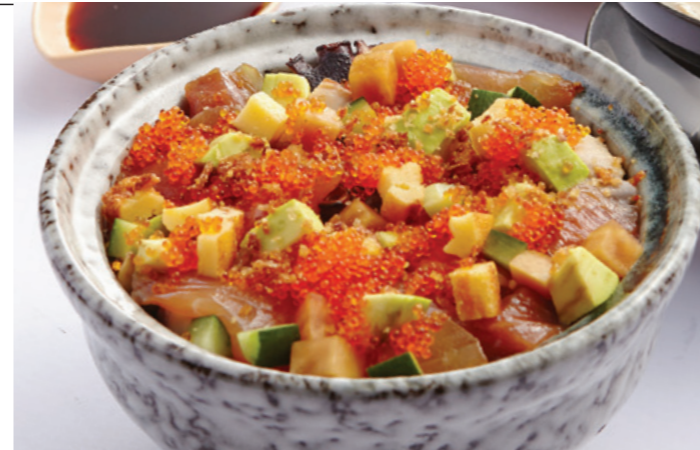
Bara Chirashi A bowl of sushi rice topped with mixed fish and vegetables. ばらちらし (お味噌汁付) It comes with miso soup. RM35.00