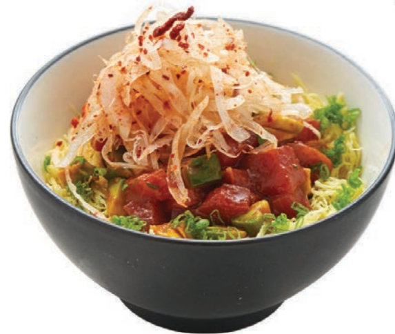
Spicy Don A bowl of sushi rice topped with spicy marinated diced tuna/salmon and avocado. スパイシー丼 (鮭もしくはサーモン) (お味噌汁付) Tuna RM90.00 Salmon RM40.00 It comes with miso soup.