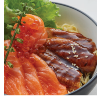
Unagi Salmon Don A bowl of sushi rice topped with salmon and grilled eel 鰻サーモン丼 (お味噌汁付) It comes with miso soup. RM45.00