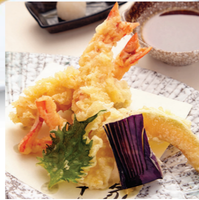
Assorted Tempura Set RM55.00 Prawn tempura and assorted vegetable tempura. 天麩羅御膳 (海老・野菜)