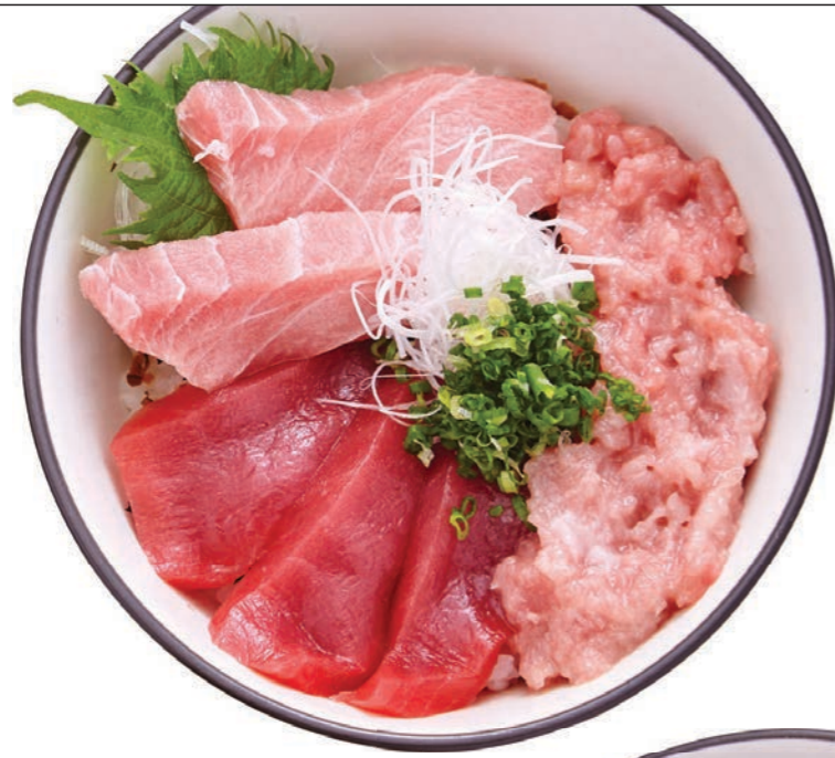
Premium Tuna Don A bowl of sushi rice topped with 2 parts of tuna and minced tuna mid belly. プレミアムまぐろ丼 (中トロ・赤身・ネギトロ) (お味噌汁付) It comes with miso soup. RM120.00