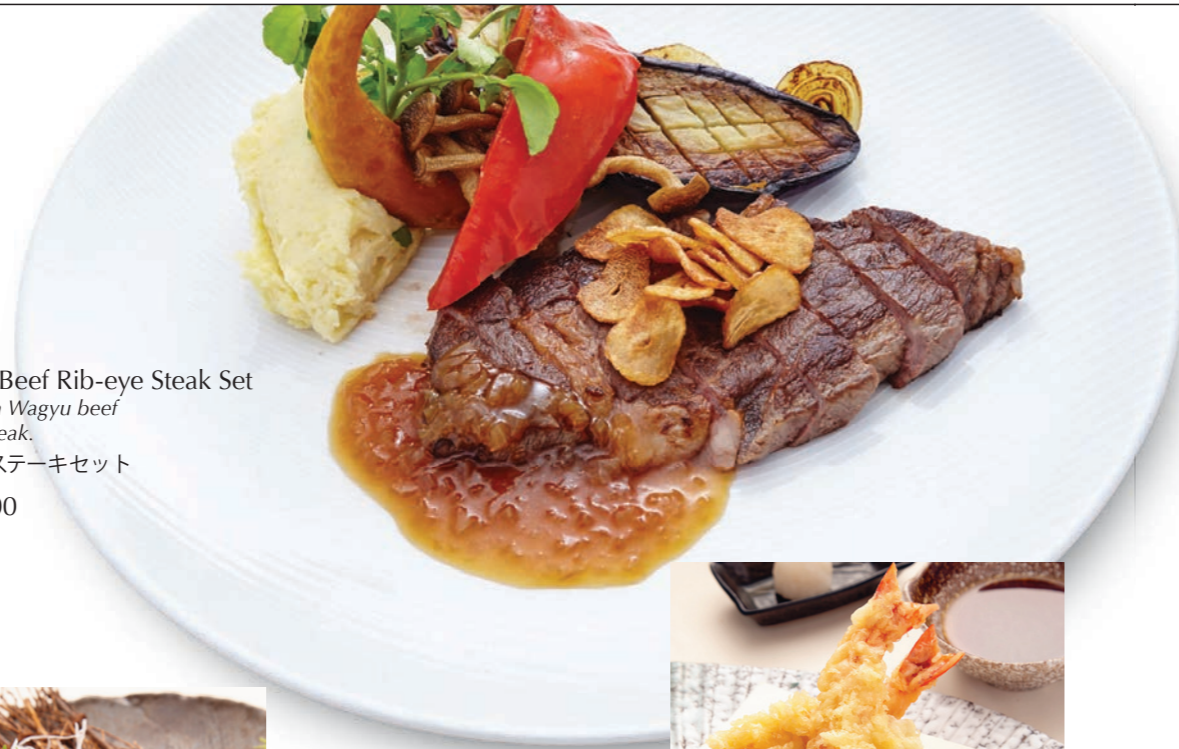
Wagyu Beef Rib-eye Steak Set Australian Wagyu beef rib-eye Steak. リブアイステーキセット RM92.00