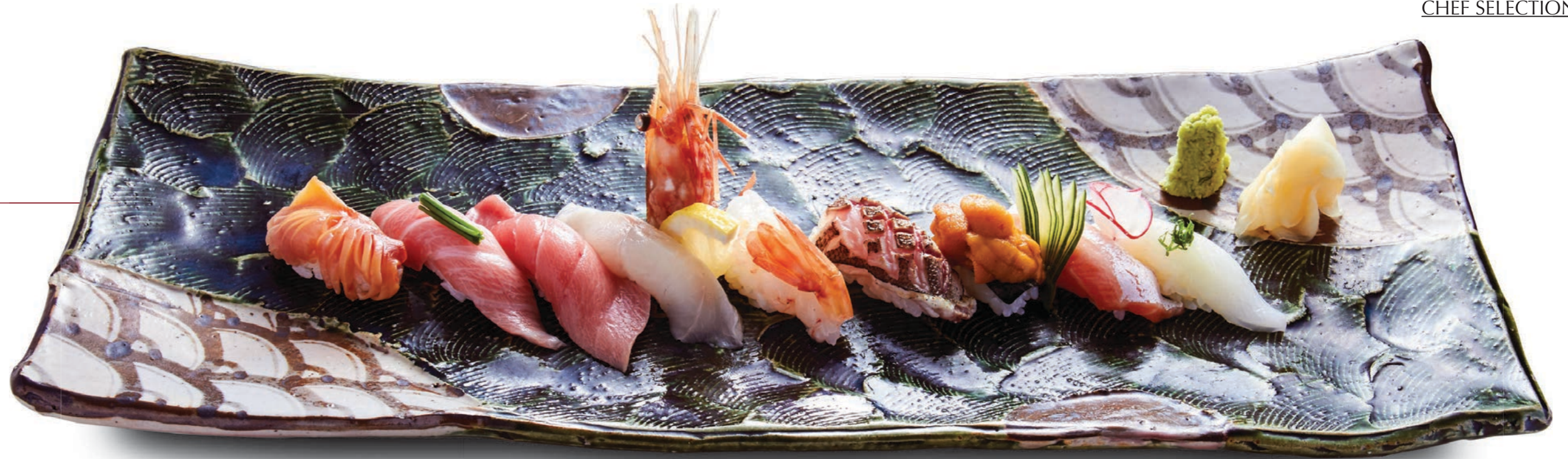
Tokujo Sushi (Exclusive)

Nami Sushi (Regular) Nigiri sushi 7 pcs and small rolls. 並握り(握り7貫・細巻き) (お味噌汁付) It comes with miso soup. RM90.00