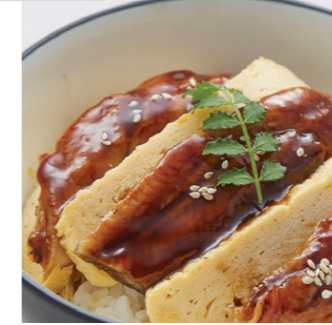
Una Tama Don A bowl of sushi rice topped with grilled eel and traditional Japanese rolled omelette. 鰻玉丼 (お味噌汁付) It comes with miso soup. RM42.00