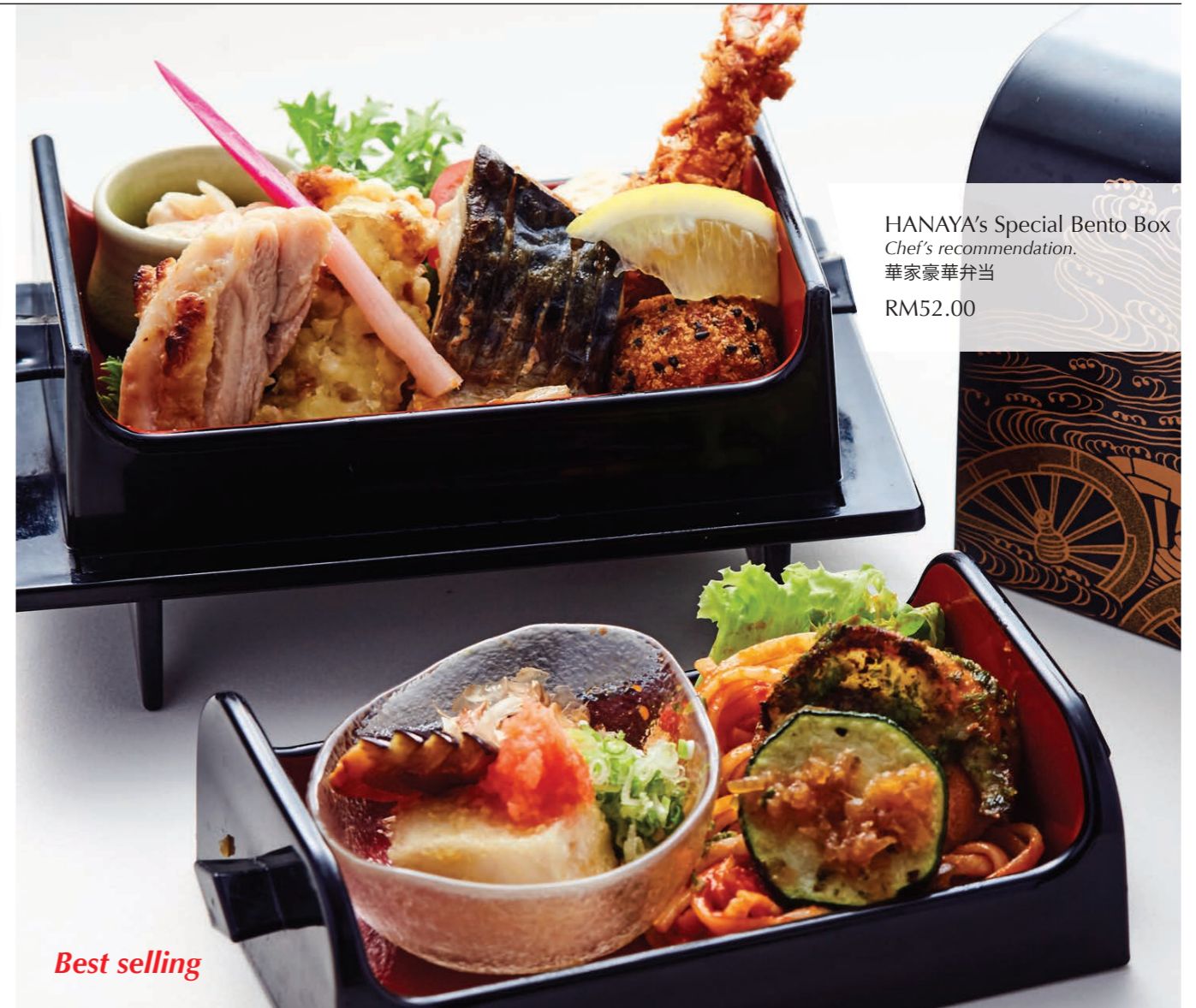
HANAYA's Special Bento Box Chef's recommendation. 華家豪華弁当 RM52.00