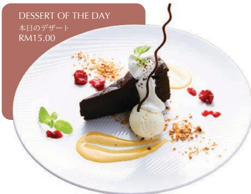
DESSERT OF THE DAY 本日のデザート RM15.00

Tokujo Sushi (Exclusive) Nigiri sushi 9 pcs and chef's selected mini bowl. 特上寿司(握り9貫・小丼ぶり) (お味噌汁付) It comes with miso soup. RM200.00