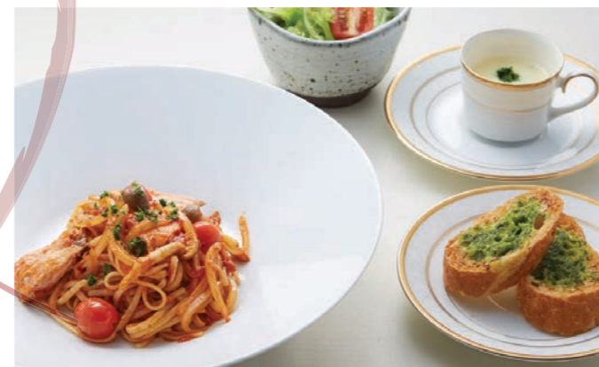
Seafood Tomato Pasta