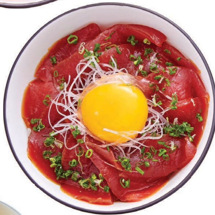
Zuke Maguro Don A bowl of sushi rice topped with marinated bluefin tuna. 漬まぐろ丼 (お味噌汁付) It comes with miso soup. RM90.00